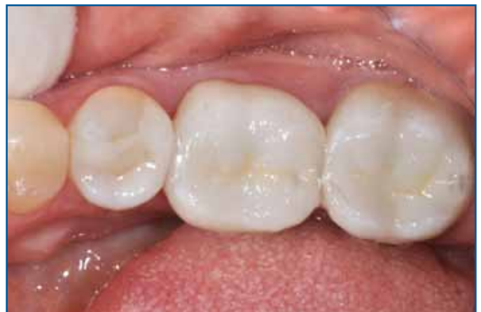
After Porcelain Crowns, Inlays, White Fillings

Read our Informed Treatment Brochures for further details