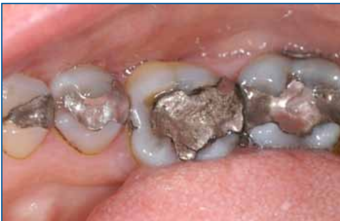
Old Amalgam Fillings